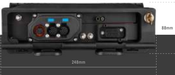
APX 8500 High-Power Model Shown